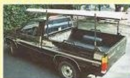
12' (3.65m) Model Fits Atop The Smallest Compacts