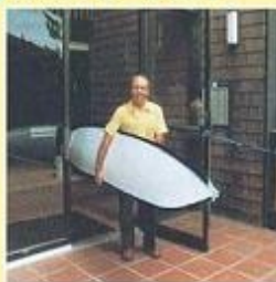
8' (2.44m) Model "Keep It In Your Condo!"