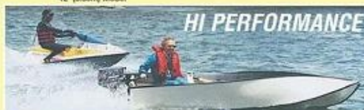
12' (3.65m) Model

Speeds Of Up To 20 MPH with A 5 HP Outboard